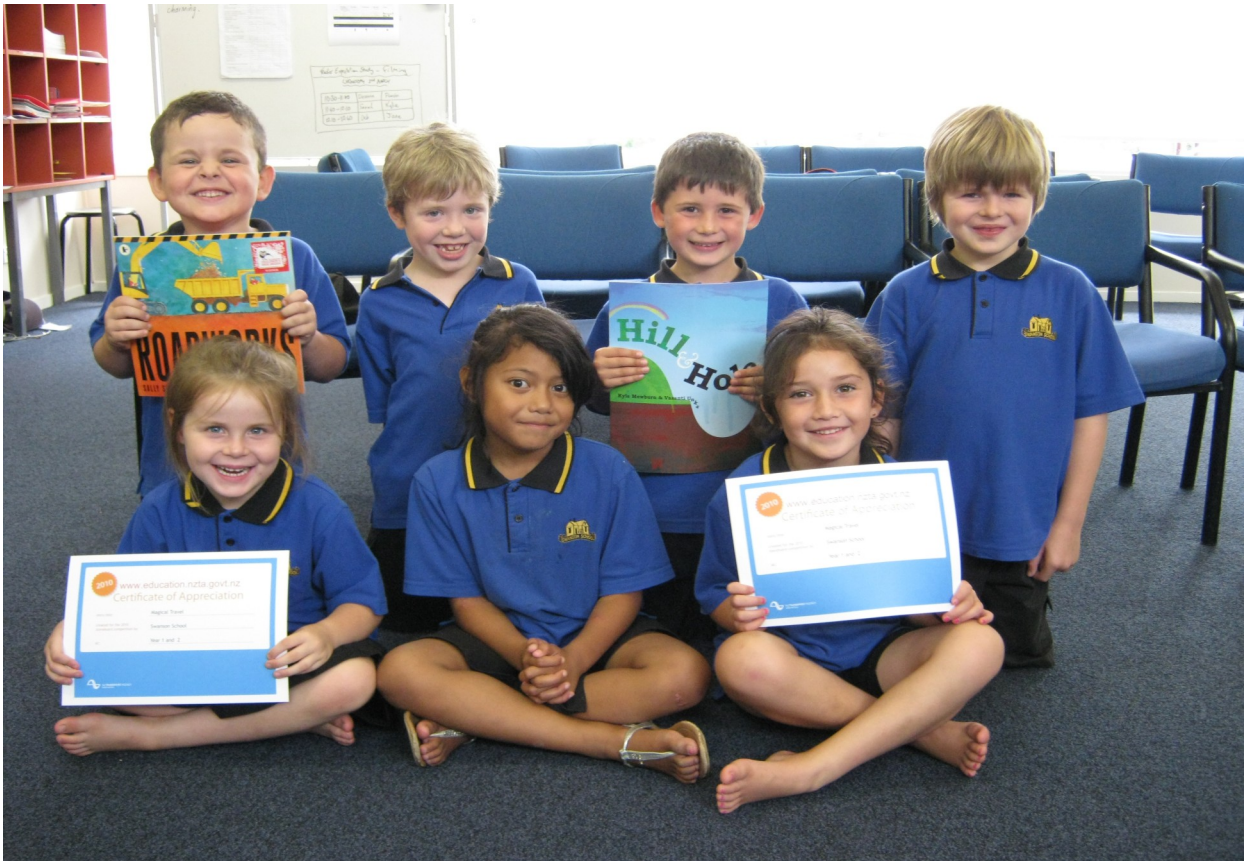
Just some of our proud students